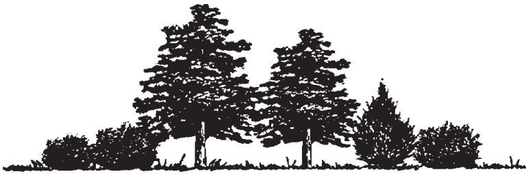
Figure 2: Ladder fuels enable fire to travel from the ground surface into shrubs and then into the tree canopy.

variety of textures and color and help reduce soil erosion. Consider ground cover plants for areas where access for mowing or other maintenance is difficult, on steep slopes and on hot, dry exposures.